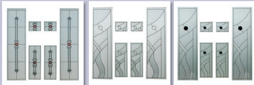
Glass type: TG10 Satinized