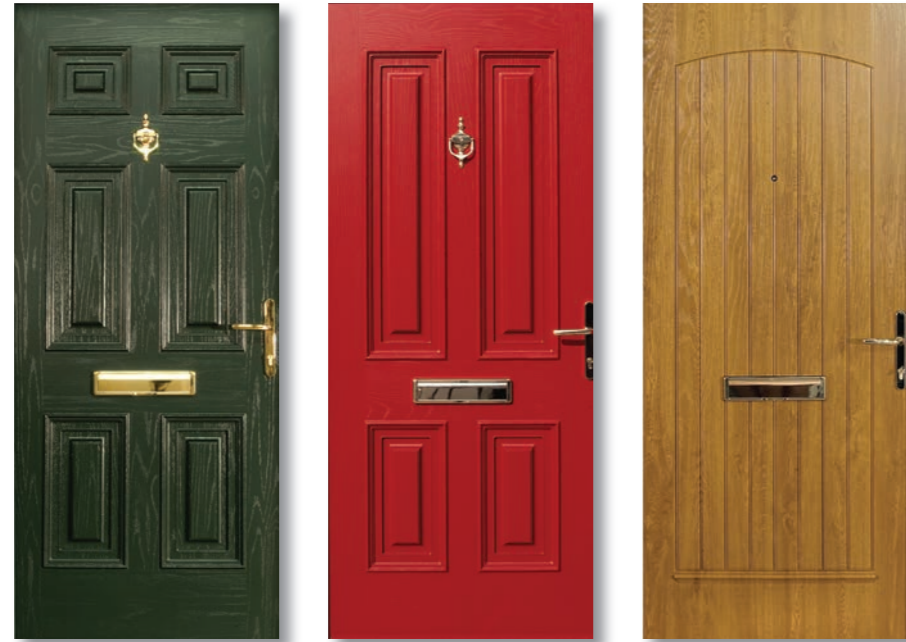
Georgian CD Solid